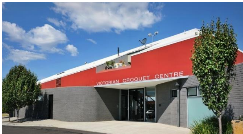
Victorian Croquet Centre

Please note that Atkins Quadway hoops will be used during this tournament (and the Open Singles).